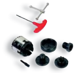
10000610 Mini lathe chuck 1" x 8 TPI, Ø 65 mm, with 3 jaw sets and screw insert