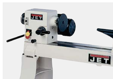
Pivoting headstock turns 360° over the entire length of the bed