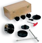
10000612 Lathe chuck M33x3,5, Ø 115 mm, with 3 jaw sets and screw insert