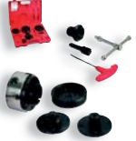
10000611 Lathe chuck M33x3,5, Ø 95 mm, with 3 jaw sets and screw insert