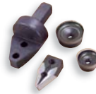
10003370 Set of copy tools