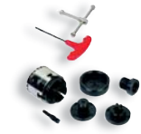
10000610 Mini lathe chuck 1" x 8 TPI, Ø 65 mm, with 3 jaw sets and screw insert