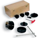
10000612 Lathe chuck M33x3,5, Ø 115 mm, with 3 jaw sets and screw insert