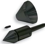
709933 Live center MT-2