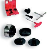
10000611 Lathe chuck M33x3,5, Ø 95 mm, with 3 jaw sets and screw insert