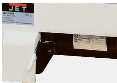
Quick release lever for easy belt tensioning