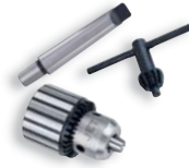
708343 K Drill chuck 13 mm, with tapered mandrel MT-2