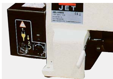
Variable speed control