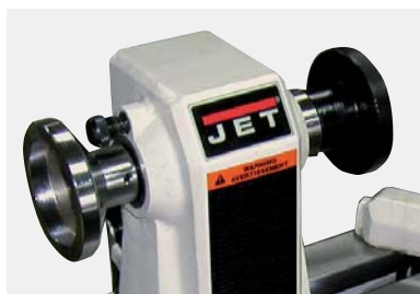
Spindle indexing every 15°