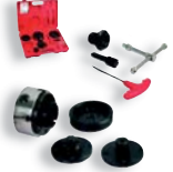
10000611 Lathe chuck M33x3,5, Ø 95 mm, with 3 jaw sets and screw insert