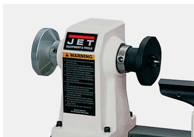
1" x 8TPI (+ Adapter M33 x 3,5 mm)