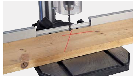
Cross laser for easy operation