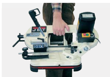
Easy to carry