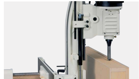
Work in a 180° tilted condition